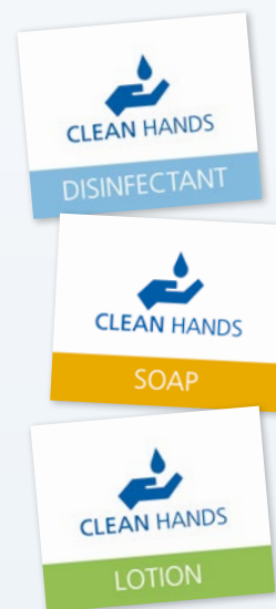
Sticker kit for unique identification of the dispenser content