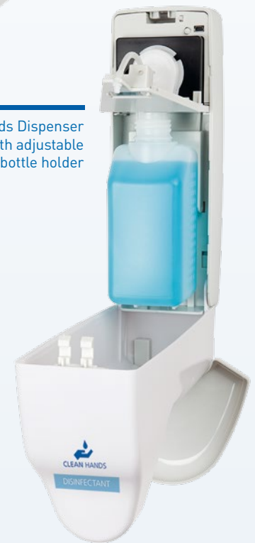
Clean Hands Dispenser with adjustable bottle holder

The METEKA Clean Hands Dispenser significantly improves the hygiene situation and complies with the recognised guidelines.