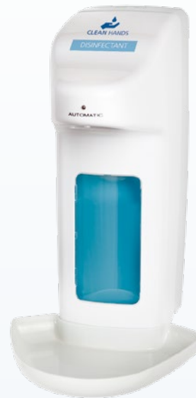
Clean Hands Dispenser with dripping pan